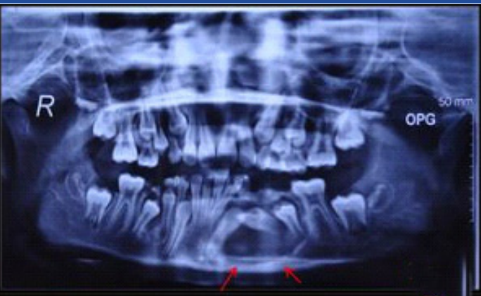
[Table/Fig-3]: Shows well-defined unilocular radiolucency extending from 32-36 with impacted 33 & 34 (Dentigerous cyst)

The results for odontogenic tumours are summarized in [Table/ Fig-5]. The predominant types noticed were keratocystic odontogenic tumour (KCOT) (n=11), ameloblastoma (n=8), unicysticameloblastoma (UA) (n=7), adenomatoidodontogenictumour (AOT) (n=7), and others. KCOTs showed an almost equal sex predilection, with posterior mandible being the favoured site [Table/ Fig-2]. Unilocular radiolucencies were observed in five cases, multilocular radiolucencies were observed in four cases and only two cases showed associations of impacted teeth with unilocular radiolucencies [Table/Fig-4].